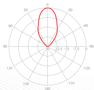
V/H - Port Pattern Azimuth 5.6 GHz